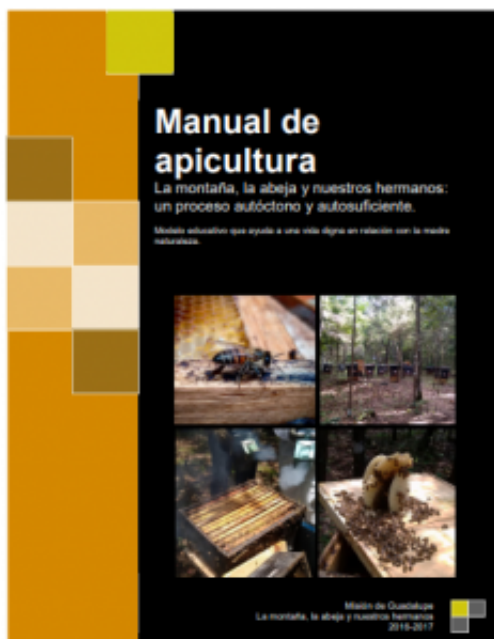
Manual de apicultura 2016

[/et_pb_text][et_pb_column][et_pb_row][et_pb_section]